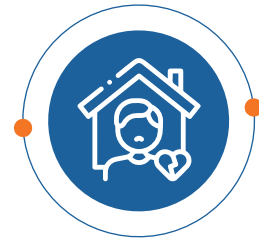
Food Security Programs.