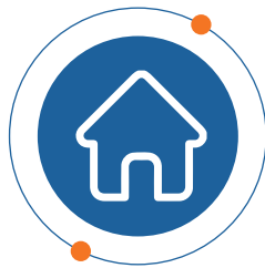
Housing and Shelter Programs.