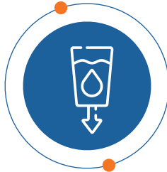
Water, Sanitation, and Hygiene (WASH) Programs.