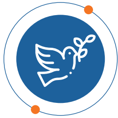
Peace Building and Advocacy Programs.