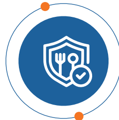
Orphan Sponsorship Programs.